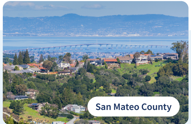
San Mateo County