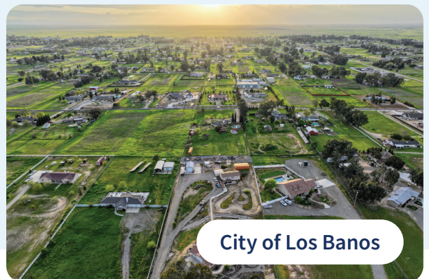
City of Los Banos