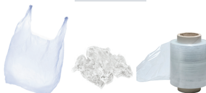
PLASTIC BAGS, FILM PLASTIC