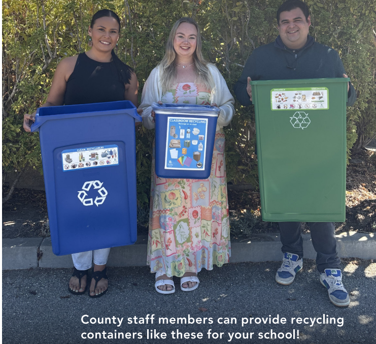
County staff members can provide recycling containers like these for your school!

Call 831.636.4110 or email sbcilm@sanbenitocountyca.gov for more information.