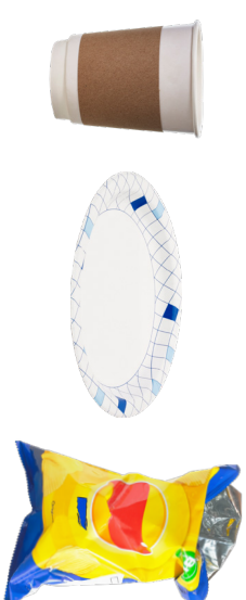
SNACK BAGS, WRAPPERS, AND COATED PAPER PRODUCTS