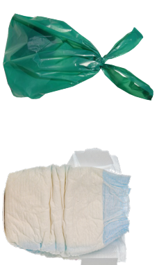
BAGGED ANIMAL WASTE AND DIAPERS