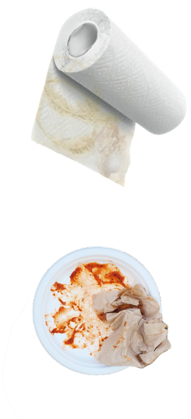
UNCOATED FOOD-SOILED PAPER PRODUCTS