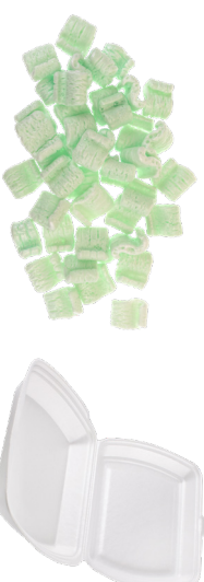
PACKAGING AND POLYSTYRENE FOAM