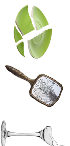
CERAMICS AND MISC. GLASS