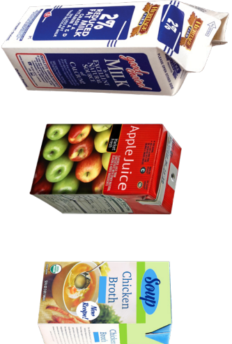
CARTONS AND ASEPTIC PACKAGING