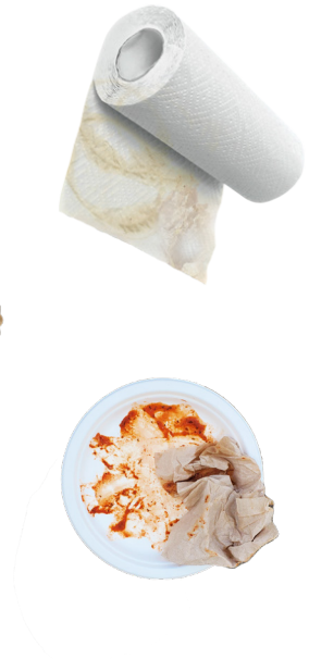
UNCOATED FOOD-SOILED PAPER PRODUCTS