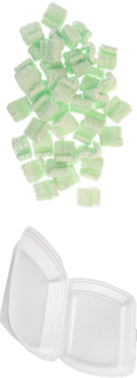
PACKAGING AND POLYSTYRENE FOAM