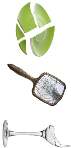
CERAMICS AND MISC. GLASS