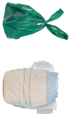
BAGGED ANIMAL WASTE AND DIAPERS