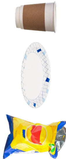
SNACK BAGS, WRAPPERS, AND COATED PAPER PRODUCTS