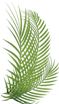
OLEANDER, POISON OAK, AND PALM TREES