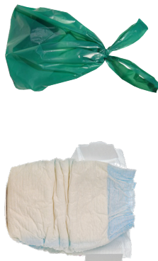
BAGGED ANIMAL WASTE AND DIAPERS