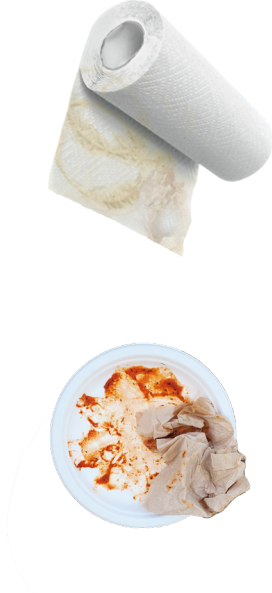
UNCOATED FOOD-SOILED PAPER PRODUCTS