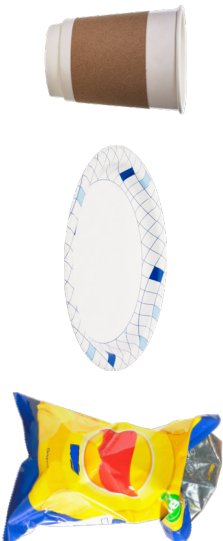
SNACK BAGS, WRAPPERS, AND COATED PAPER PRODUCTS