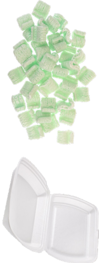
PACKAGING AND POLYSTYRENE FOAM