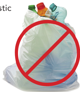
Don't bag recyclables. Place items directly in the recycling container.

For all these reasons, Recology Vallejo is asking customers to "Loose Load" recyclables.