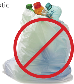
Don't bag recyclables. Place items directly in the recycling container.

Plastic bags make it difficult for workers to sort recyclables properly and safely. It also slows the process and increases the cost of recycling. Plastic bags and other flimsy plastics can wrap around equipment, requiring operations to shut down while workers climb onto the