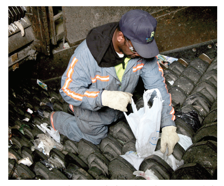
Operations must be stopped when plastic bags get tangled in machines, which could increase costs and be dangerous for workers.

Please do not put plastic bags in your blue or green bin. Flimsy plastics contaminate recycling and compost. Contaminated bins will either not be serviced, or a fee will be levied for servicing them as trash.