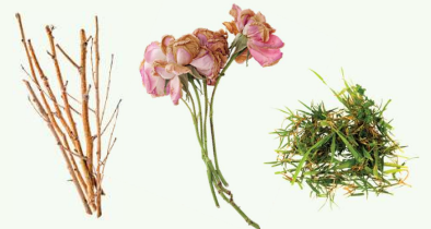
PLANTS AND YARD TRIMMINGS