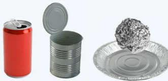
METAL CANS AND LIDS, CLEAN FOIL