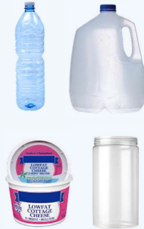
PLASTIC BOTTLES, TUBS, JUGS, AND JARS