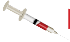
MEDICAL SHARPS OBJETOS PUNZOCORTANTES MÉDICOS

When propane tanks and batteries encounter our equipment, they can cause extremely dangerous fires. They must be disposed of as hazardous waste. Cuando los tanques de propano y las baterías se encuentran con nuestro equipo, pueden causar incendios extremadamente peligrosos. Deben desecharse como residuos peligrosos.