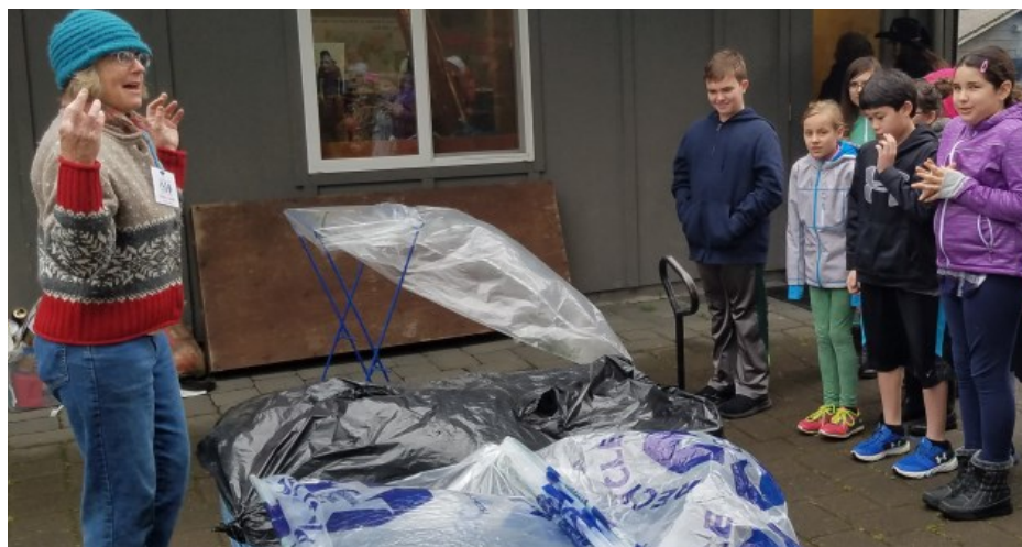
Participating in school events.