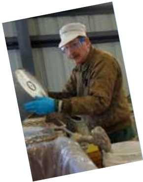
Working on the recycled paint program.

Get involved in a variety of projects in their efforts to raise community awareness and educate others.