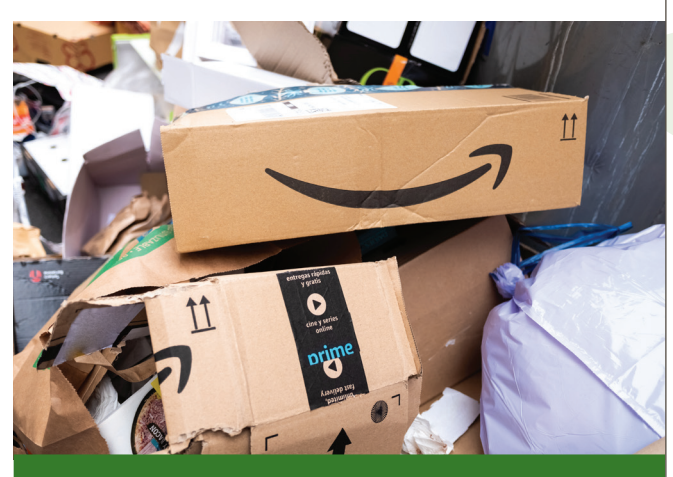
If you aren't sure if something is recyclable, visit www.WhatBin.com to find out.

Thank you for helping to protect our environment this holiday season!