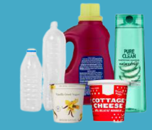
Rigid Plastic Containers