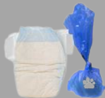
Diapers & Pet Waste