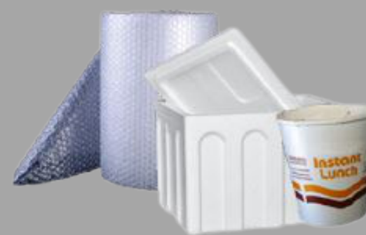
Foam & Bubble Wrap