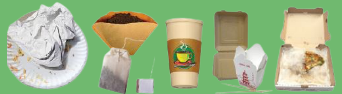
Food & Beverage Soiled Paper