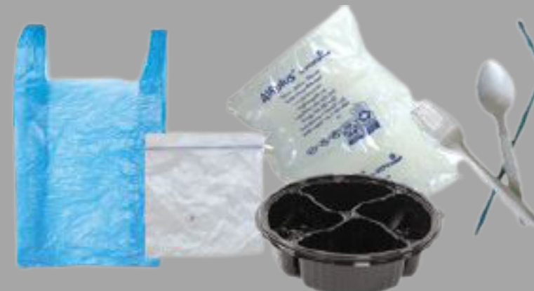
Plastic bags, Film, Cutlery, Straws, Black Plastic