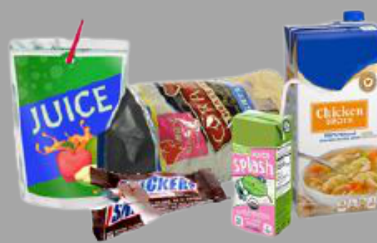
Snack Wrappers, Chip Bags, Juice/Soup Boxes

Put non-recyclable and non-toxic items in the grey container.