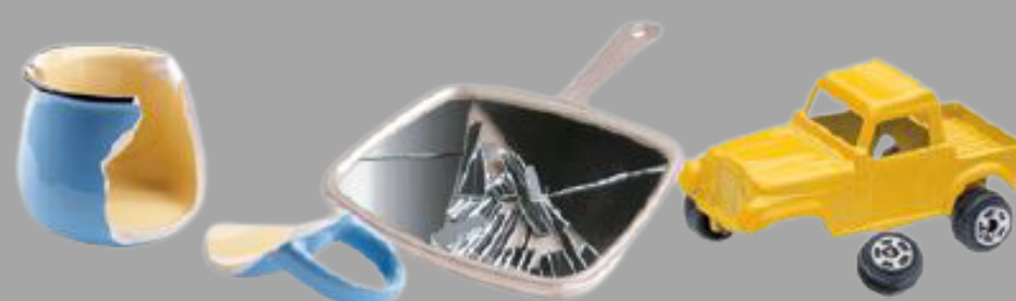
Broken Ceramics, Mirrors, Toys