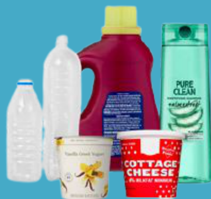
Rigid Plastic Containers