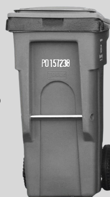
20 gallon (32 gal with insert)

Need a smaller or larger size landfill bin? Call our office to inquire about sizing and cost.