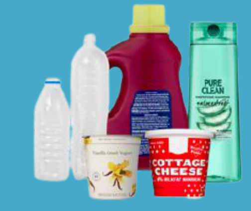
Rigid Plastic Containers