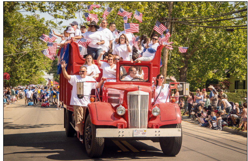
(Above) Recology employees, family, and friends celebrate in the vintage garbage truck. (Left) Recology mascot "Binny Green" greets his fans. (Bottom left) The Drill Team performs during the parade with their old-fashioned collection cans. (Bottom right) The Recology Drill Team readies to perform for the May Fair judges.

After a historic two year absence due to Covid-19, the Dixon May Fair is back! Don't miss the celebration on Saturday, May 7, when the Drill Team from Recology Dixon will be rocking the streets at the 145 th Dixon May Fair. The entire Recology team will be out in full force during the parade. The Drill