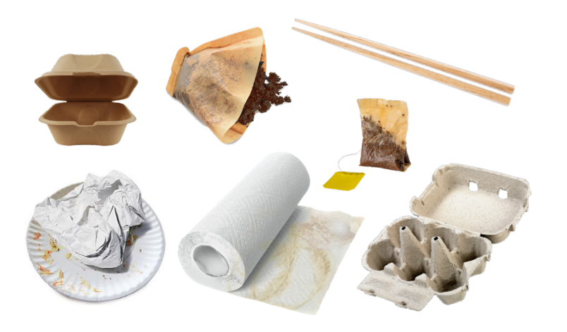
UNCOATED SOILED PAPER