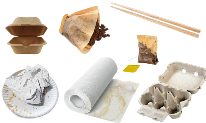
UNCOATED SOILED PAPER