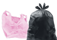
1. Plastic Bags / Film Plastic Bolsas y Película de Plástico