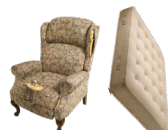
12. Bulky Item Artículo Grande