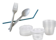
6. Small Plastics Pequeños Plásticos