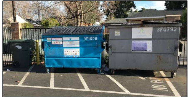
Examples of container placement for containers to be serviced with direct drive up access.

What street will RSMC trucks be servicing from? _____