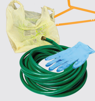
Plastic Bags & Film Plastics, Hangers, Hoses, Gloves