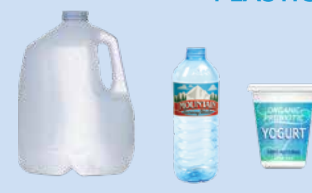
Rigid plastic bottles and tubs - NO LIDS