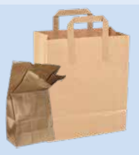
Empty paper bags