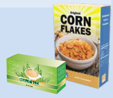
Clean boxes & cartons