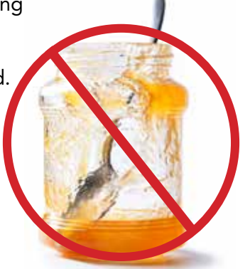
Wipe or rinse out items