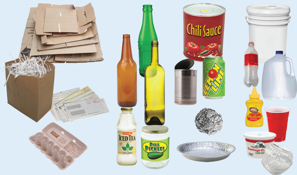
Paper, Cardboard, Paper Egg Cartons, Newspaper, Magazines, Junk Mail

Mandatory Commercial Recycling Law (AB 341) requires all businesses that generate four (4) or more cubic yards of garbage per week and all multi-family complexes (5+ units) to arrange for recycling collection. To learn more, visit CalRecycle.ca.gov