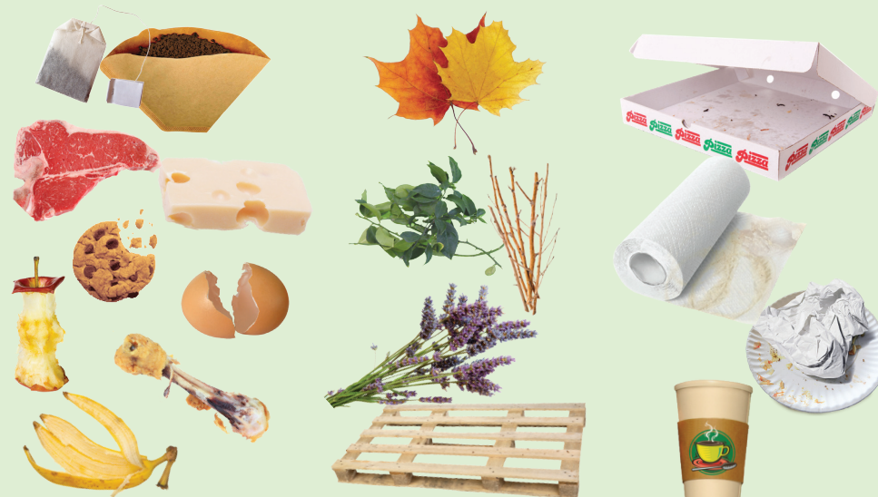
Food Scraps, including Meat, Shells, Fish, Bones, Fruit, Vegetables, Dairy

Mandatory Commercial Organics Recycling Law (AB 1826) requires businesses and multi-family complexes (5+ units) that generate specified amounts of waste to arrange for organics collection. To learn more, visit CalRecycle.ca.gov