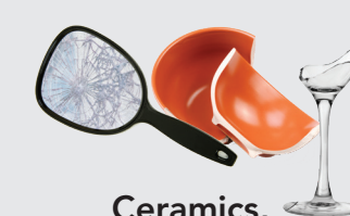
Ceramics, Glassware, Mirrors, Window Glass