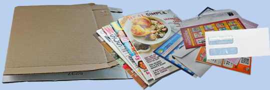
Flattened cardboard, Mail, magazines, mixed paper