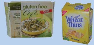
Clean boxes & cartons