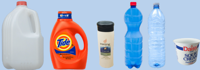
Plastic bottles and tubs