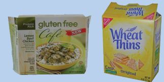
Clean boxes & cartons