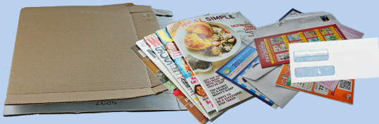
Flattened cardboard, Mail, magazines, mixed paper