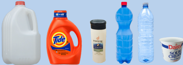
Plastic bottles and tubs