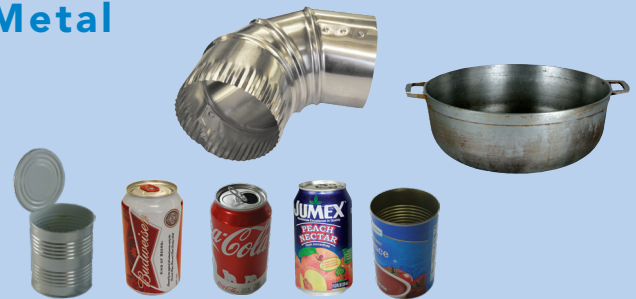
Tin, aluminum and scrap metal