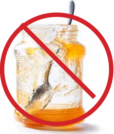
Wipe or rinse out items