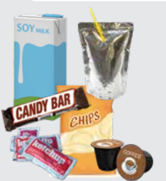
Snack Wrappers, Juice & Soup Boxes, Juice Pouches, Condiment Packets

California law prohibits the disposal of hazardous waste in landfills. These materials may contain mercury, lead, and other substances that are hazardous to human health and the environment. To learn more, visit CalRecycle.ca.gov