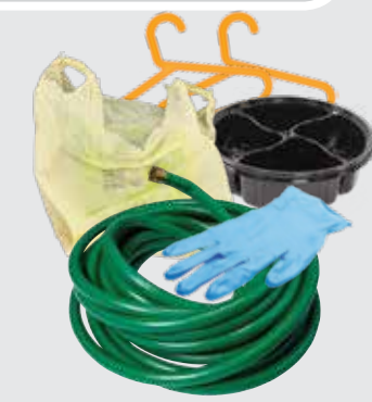
Plastic Bags & Soft Plastics, Black Plastic, Hangers, Hoses, Gloves