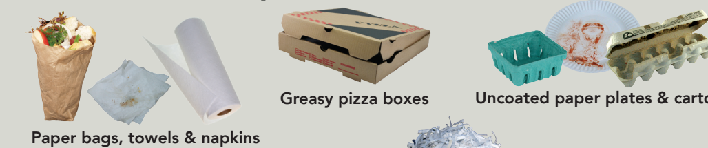
Paper bags, towels & napkins Greasy pizza boxes Uncoated paper plates & cartons Approved compostable packaging Visit recologycleanscapes.com for a complete list Shredded paper (loose or in paper bag) Wooden popsicle sticks & chopsticks