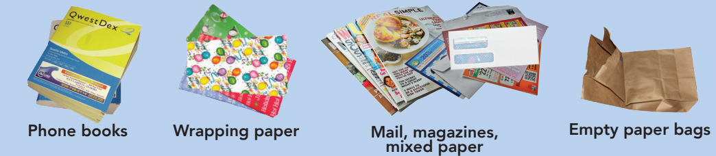
Phone books Wrapping paper Mail, magazines, mixed paper Empty paper bags