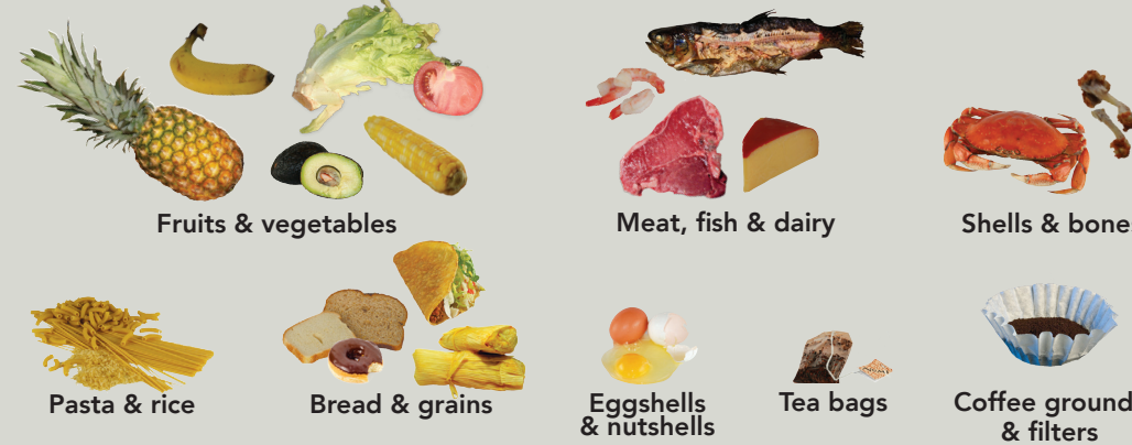
Fruits & vegetables Meat, fish & dairy Shells & bones Pasta & rice Bread & grains Eggshells & nutshells Tea bags Coffee grounds & filters