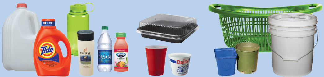
Plastic bottles (NEW! All colors — please place caps back ON plastic bottles) Plastic cups & food containers Plastic pots, buckets & baskets