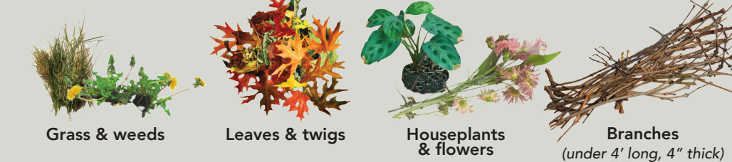
Grass & weeds Leaves & twigs Houseplants & flowers Branches (under 4' long, 4" thick)