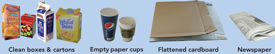
Clean boxes & cartons Empty paper cups Flattened cardboard Newspaper