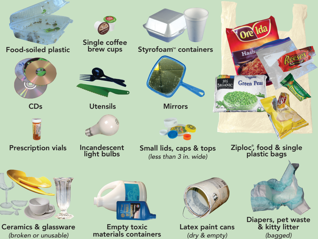
Food-soiled plastic Single coffee brew cups Styrofoam™ containers CDs Utensils Mirrors Prescription vials Incandescent light bulbs Small lids, caps & tops (less than 3 in. wide) Ziploc®, food & single plastic bags Ceramics & glassware (broken or unusable) Empty toxic materials containers Latex paint cans (dry & empty) Diapers, pet waste & kitty litter (bagged)