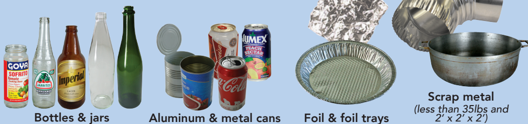
Bottles & jars Aluminum & metal cans Foil & foil trays Scrap metal (less than 35lbs and 2' x 2' x 2')