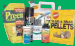
Lawn & Garden Products No professional grade