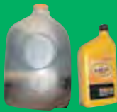
Used & Unused Motor Oil