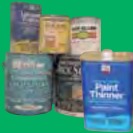
Oil-based Paints, Thinners & Stains No latex