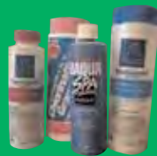
Pool & Spa Supplies