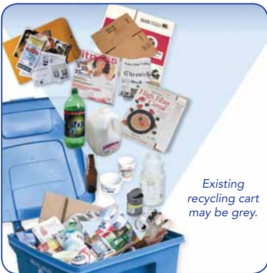
Existing recycling cart may be grey.

Below is a list of materials that are accepted in the Single-Stream Recycling Program: