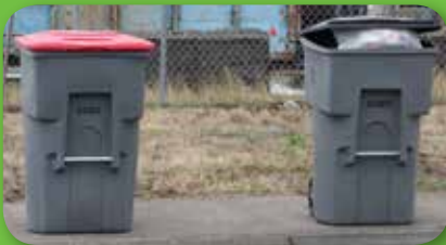
Carts -- placed 4 feet apart