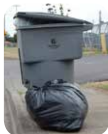
Extra will be charged - extra trash is bagged.