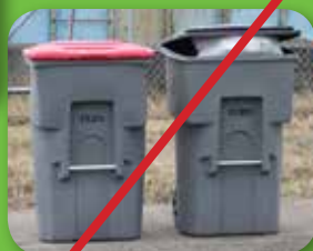
Carts too close together