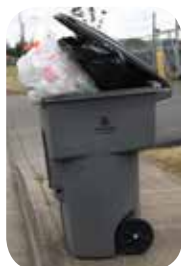
Extra will be charged.