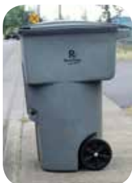
OK (no extras)

Please place loose items in bags or boxes. We charge for extra trash if the cart is over-full and the lid cannot close.