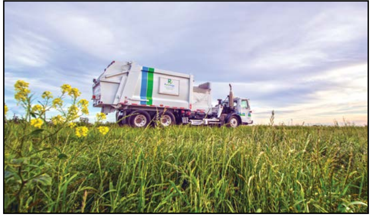
Customers will soon be able to mix a limited number of organic items with their yardwaste. Yardwaste from American Canyon is processed by Jepson Prairie Organics at the Hay Road Landfill in Vacaville (pictured above).

The start date for the new yardwaste program will be announced