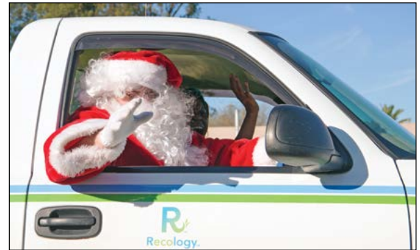
Santa and his helpers planned a surprise Christmas celebration for a family in need. Santa arrived at the family's home in a Recology truck filled with gifts for the children just in time for Christmas. Recology employees donated all the gifts and helped Santa deliver the holiday spirit to the family.

It is easy to recycle used motor oil and filters in American Canyon. Just call us and we will deliver handy oil recycling jugs. Place used motor oil in the jug and then place the jug next to your trash cart on your collection day. Empty oil jugs will be left for your next oil change.