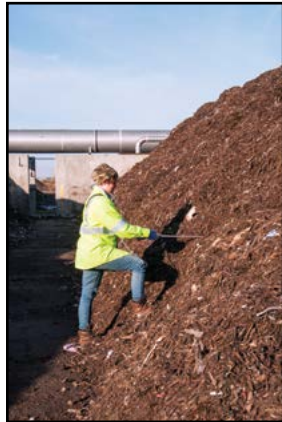
A Recology environmental expert tests the temperature of the compost.

A new compost process will soon allow American Canyon residents to mix a limited number of organic food wastes in with their yardwaste recycling. A permit is currently being updated that will allow American Canyon to join the ranks of cities like San Francisco that mix some food waste into the yardwaste to produce a rich compost. This compost is valued for its rich content and ability to conserve water. It is also approved to be used on certi-