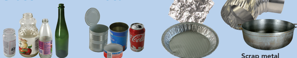
Bottles & jars