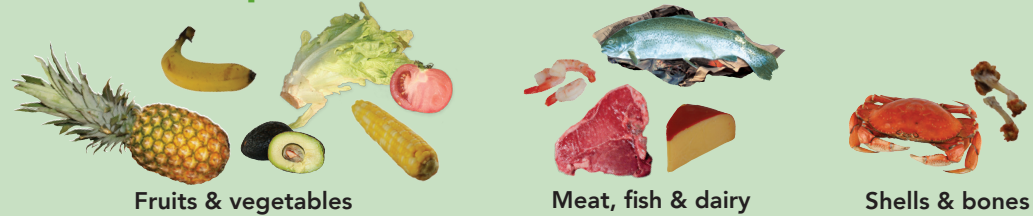
Fruits & vegetables