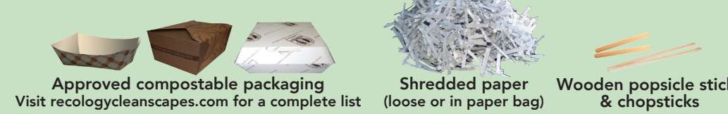
Approved compostable packaging Visit recologycleanscapes.com for a complete list