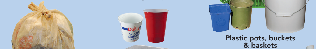
Bagged plastic bags (clean film wrap, newspaper, dry cleaner, & grocery bags) No loose plastic bags