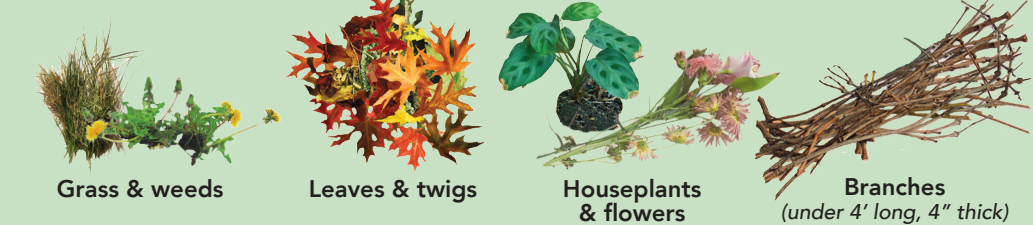
Grass & weeds