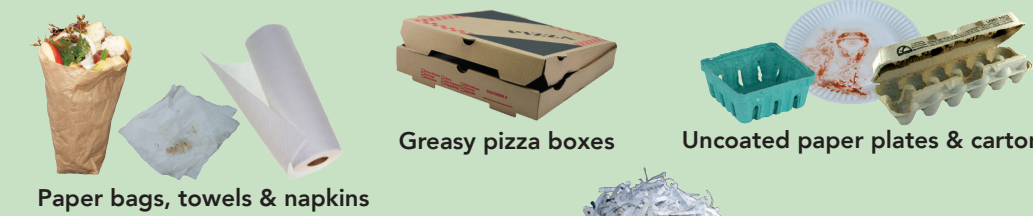
Paper bags, towels & napkins