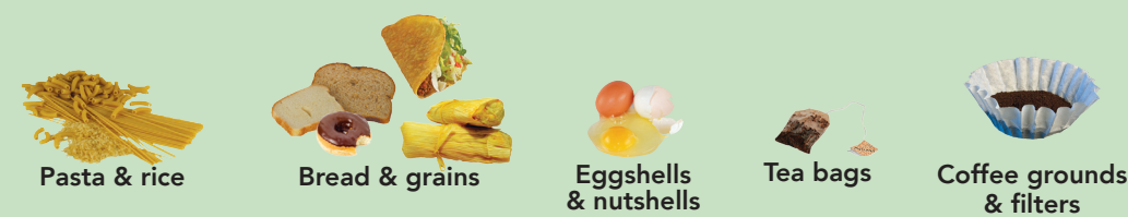
Pasta & rice