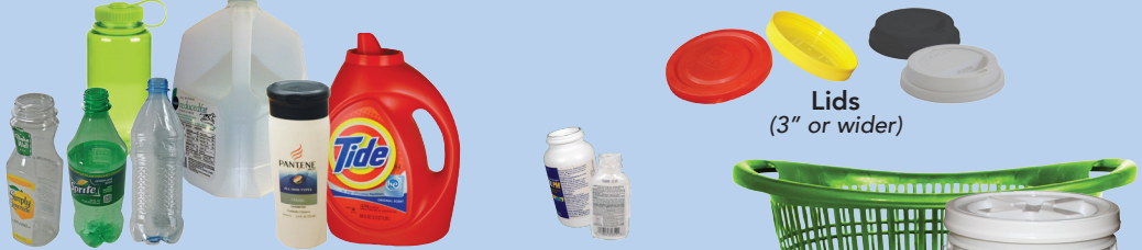
Plastic bottles (all colors)