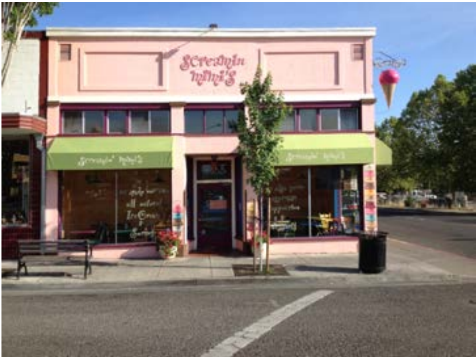
Screamin' Mimi's - Sebastopol