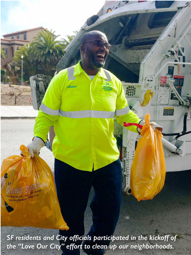
SF residents and City officials participated in the kickoff of the “Love Our City” effort to clean up our neighborhoods.