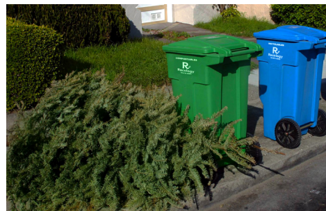
Place trees on the curb next to your bins on your scheduled collection day.

San Franciscans celebrate the holidays in many notable ways. One that continues for many residents is putting up a Christmas tree. Tree lots appear at key locations throughout the city in late November. On weekends and evenings the lots teem with activity as customers search for the perfect tree. The fragrance of cedar, pine, and noble fir fills the air. At home, a Christmas tree becomes a focal point during this wonderful time. But what happens to a tree when the holidays are over? Fortunately, San Francisco enjoys a robust Christmas tree recycling program.