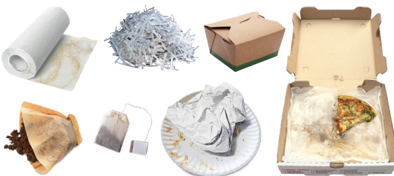
UNCOATED FOOD-SOILED PAPER PRODUCTS