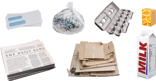
CLEAN PAPER, SHREDDED PAPER AND ASEPTIC BOXES (E.G. MILK, JUICE)

Bag shredded paper, or compost it loosely