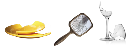
BROKEN CERAMICS, MIRRORS, WINDOW GLASS