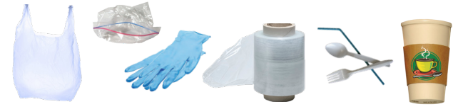
PLASTIC BAGS, FILM AND PLASTIC COATED CUPS