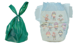
BAGGED ANIMAL WASTE AND DIAPERS