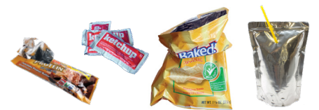
SNACK BAGS, WRAPPERS, DRINK POUCHES