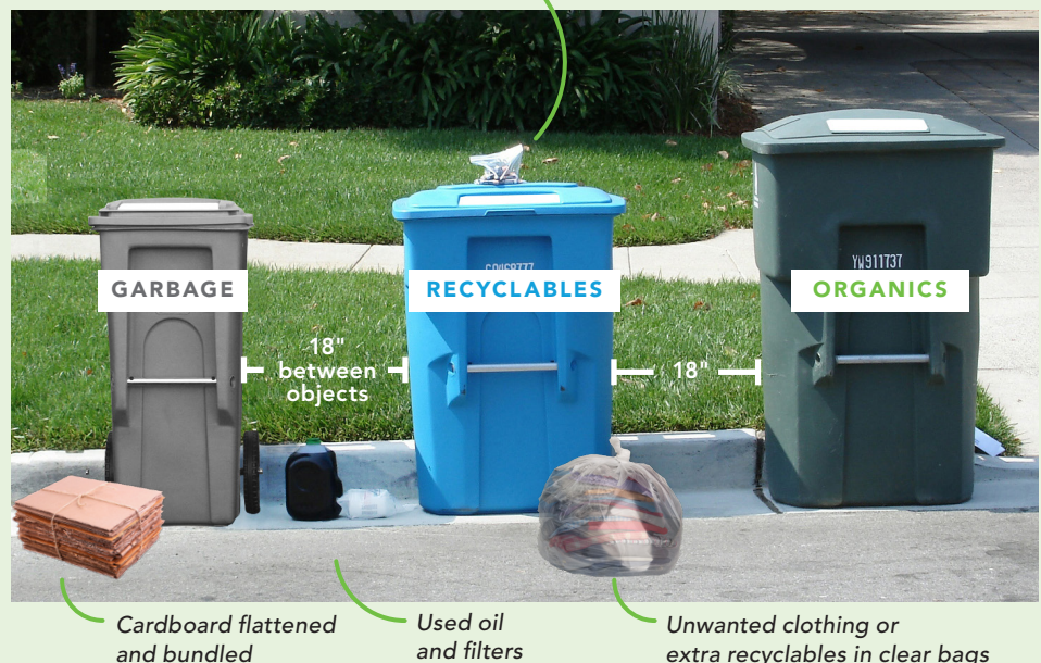
Household batteries placed in clear bag on top of recyclables cart

Lids are to remain closed at all times. Don't overfill.