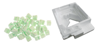
POLYSTYRENE FOAM: PACKAGING, FOOD CONTAINERS, PACKING PEANUTS