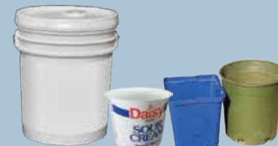
Empty plastic tubs

Please check with your local grocery store to see if a take-back program is offered to recycle plastic bags.