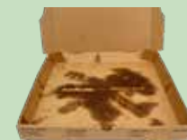
Greasy pizza boxes