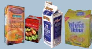
Empty boxes & cartons