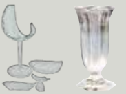
Ceramics & glassware (broken or unusable)