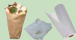
Paper bags, towels & napkins