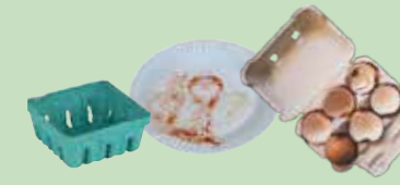
Uncoated paper plates & cartons