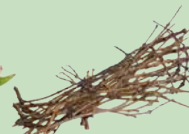
Branches & twigs (less than 4' long, 4" thick)