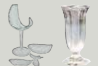
Ceramics & glassware (broken or unusable)