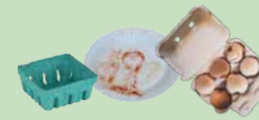
Uncoated paper plates & cartons