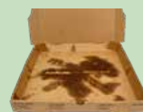
Greasy pizza boxes