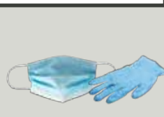
Disposable masks & latex gloves