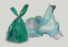
Diapers, pet waste & kitty litter (bagged)