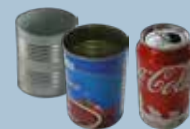
Aluminum & metal cans