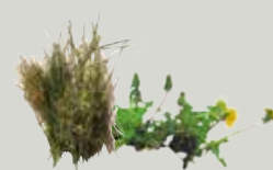
Grass & weeds