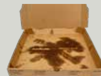
Greasy pizza boxes