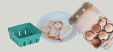
Uncoated paper plates & cartons