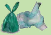
Diapers, pet waste & kitty litter (bagged)