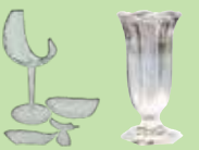
Ceramics & glassware (broken or unusable)