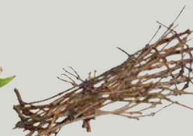
Branches & twigs (less than 4' long, 4" thick)