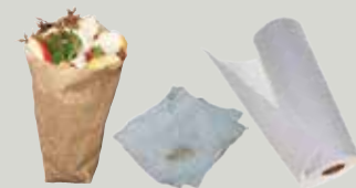
Paper bags, towels & napkins