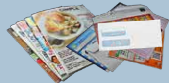
Mail, magazines & mixed paper