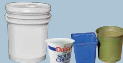
Empty plastic tubs