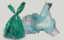
Diapers, pet waste & kitty litter (bagged)