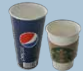
Empty paper cups