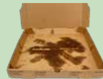
Greasy pizza boxes & waxed cardboard