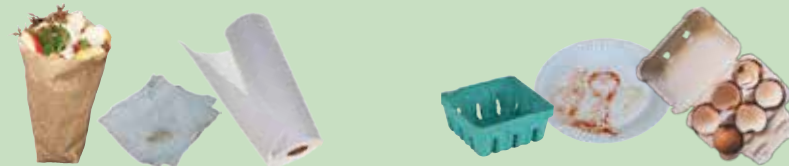
Paper bags, towels & napkins