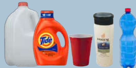
Empty plastic bottles, cups & jugs (Please place caps back ON plastic bottles.)