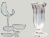
Ceramics & glassware (broken or unusable)