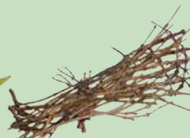
Branches & twigs (less than 4' long, 4" thick)