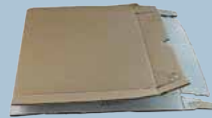
Cardboard (Please ensure all cardboard is flat.)