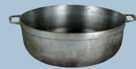
Scrap metal (less than 35lbs and 2' x 2' x 2')

⊘ NO PLASTIC BAGS OR WRAP ⊘ NO FOOD ⊘ NO LIQUID