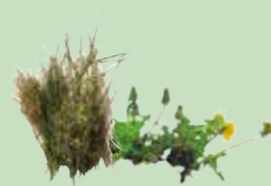
Grass & weeds