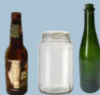
Bottles & jars