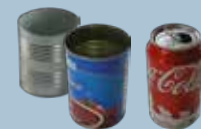
Aluminum & metal cans