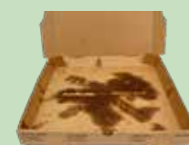
Greasy pizza boxes