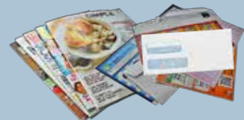
Mail, magazines & mixed paper