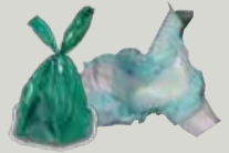
Diapers, pet waste & kitty litter (bagged)

Not sure where it goes? Call us at 206.767.1166