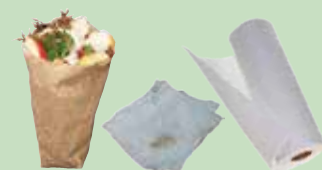
Paper bags, towels & napkins