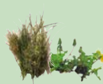
Grass & weeds