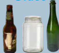
Bottles & jars