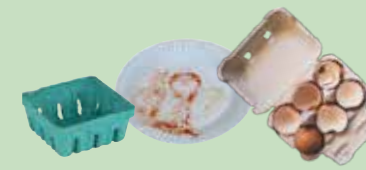
Uncoated paper plates & cartons