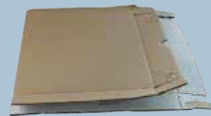
Cardboard (Please ensure all cardboard is flat.)