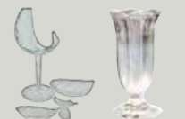
Ceramics & glassware (broken or unusable)