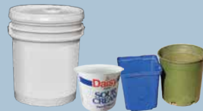
Empty plastic tubs