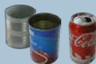
Aluminum & metal cans