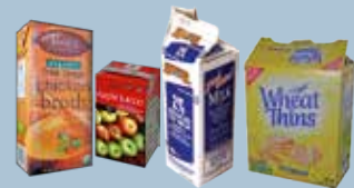
Empty boxes & cartons